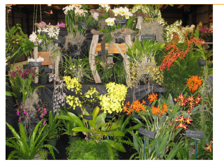
Above: PCOS Award Winner Indian River Orchids